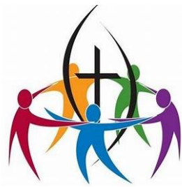
MVPC Church Leadership 2019-2020