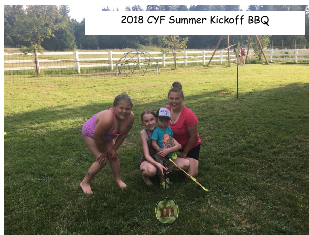
2018 CYF Summer Kickoff BBQ