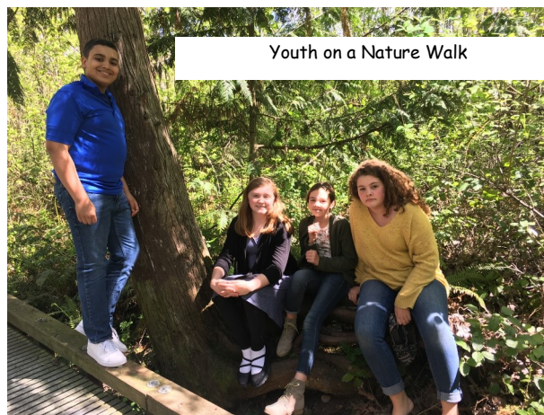
Youth on a Nature Walk