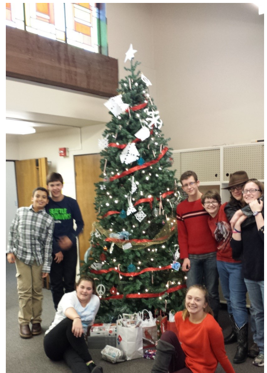
Youth Group Christmas Party