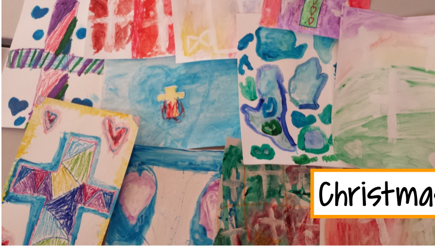
Christmas Art Party