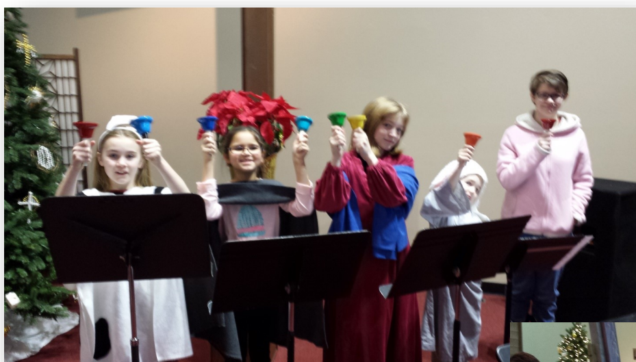
MVPC Creative Kids Playing Bells in Worship