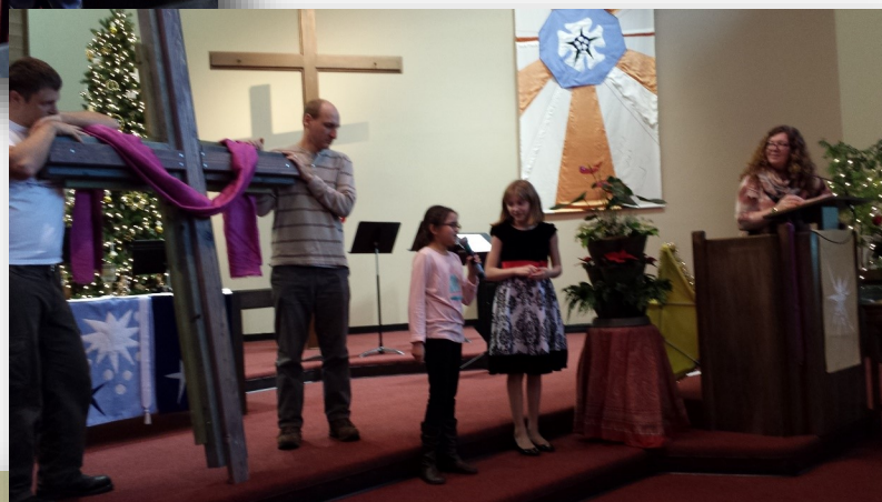
Sharing the Story of Jesus' Birth