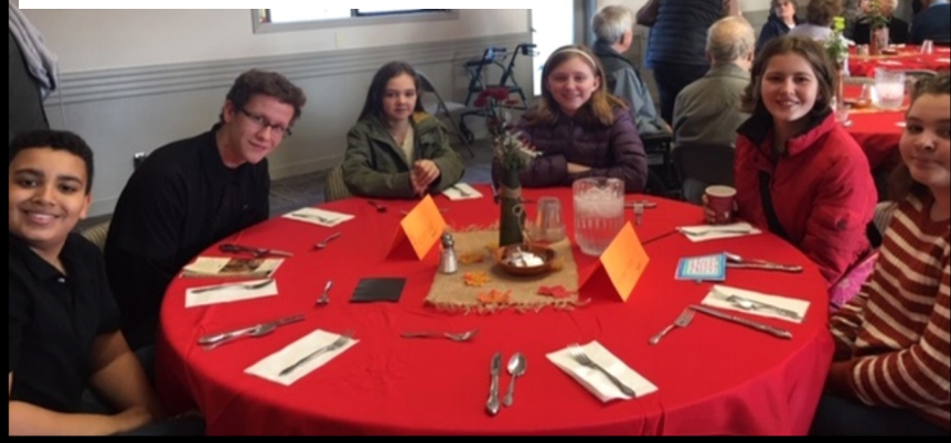
Youth at the Giving Thanks lunch