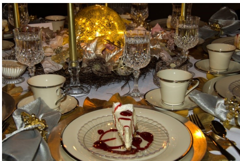
Women's Dessert 2017

"Silent Night: Finding Peace in the Busyness"